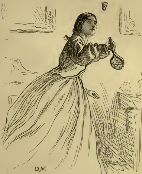
Battledore and Shuttlecock.

LONDON: RICHARD BENTLEY AND SON, Publishers in Ordinary to Her Majesty.